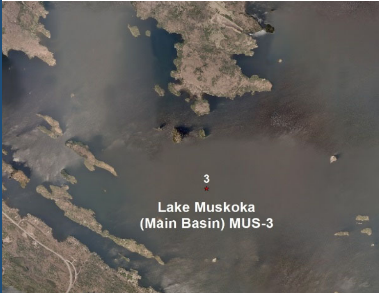
Lake Muskoka (Main Basin) MUS-3