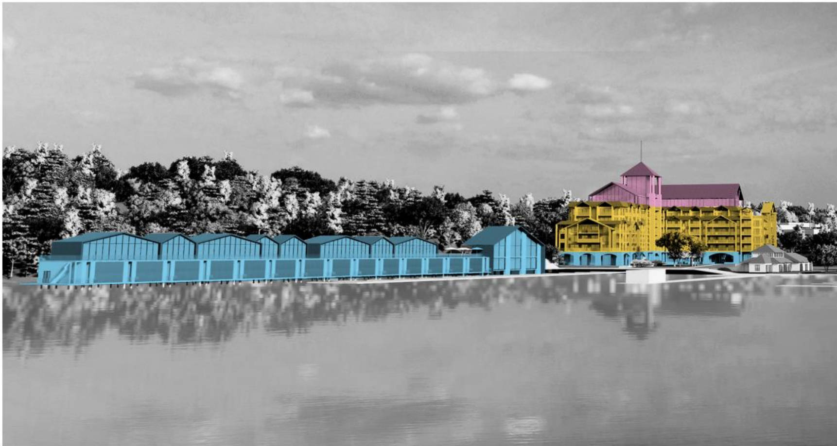
Figure 3.2: Building Elevation Concept